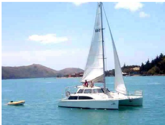
Ed. I will be away for 2 weeks, sailing the Whitsunday's out of Airlie Beach. Can't send a Post Card because I don't think we will pass a post office. But we will certainly have fun.