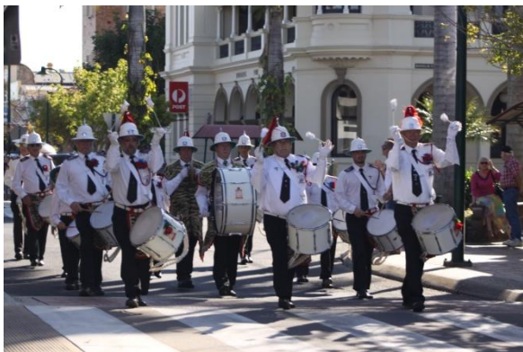
The band at last year's Bundy in Bloom, looking impressive with the Three Tenors in the front row. A GOOD LOOK!