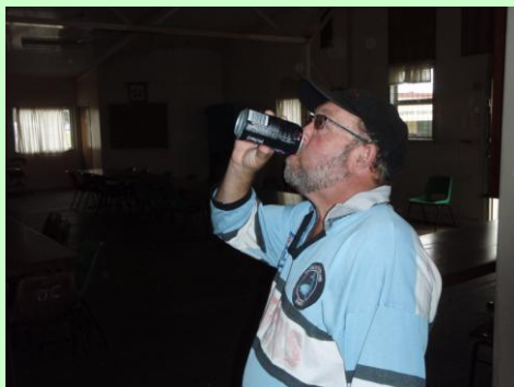
Thirsty Work on the "BEE"